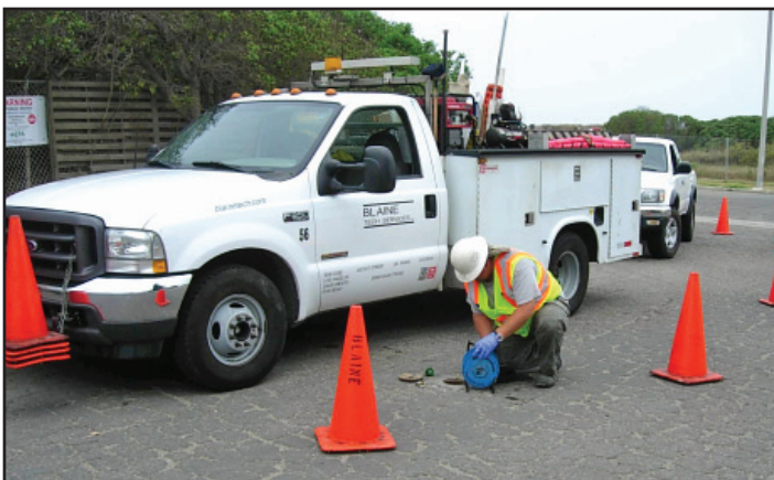
Water level measurements at the Halaco Site

The testing and investigation efforts are part of the Remedial Investigation of the Site. After sufficient information is available, most likely in late 2009, EPA will begin to identify and evaluate cleanup options as part of the Feasibility Study for the site and then make a formal cleanup proposal to the community in a document called the “Proposed Plan”.